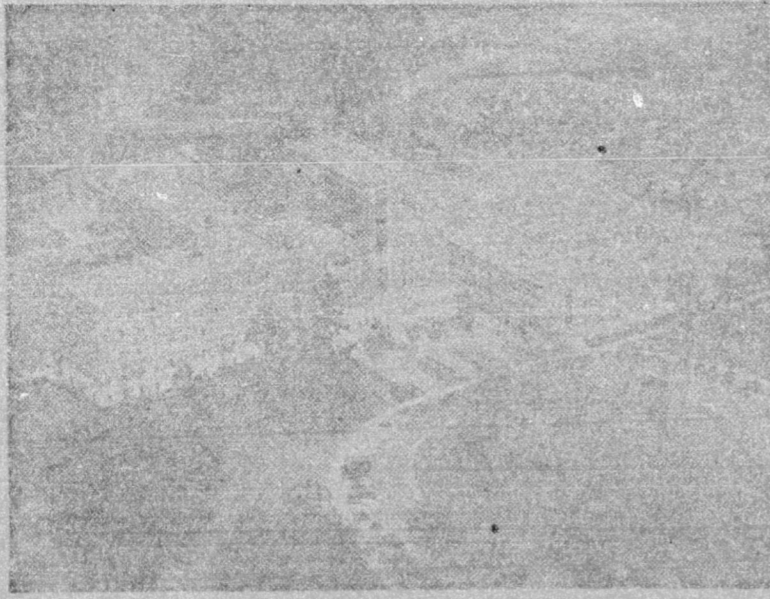
MOSES 41, CONE MEMORIAL HOSPITAL, Greensboro — another fine KINGS DOWN installation.