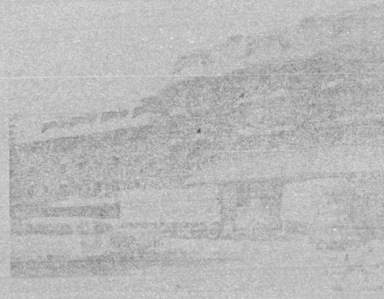
GROVE PARK INN, Asheville — 100% KINGS DOWN mattresses.