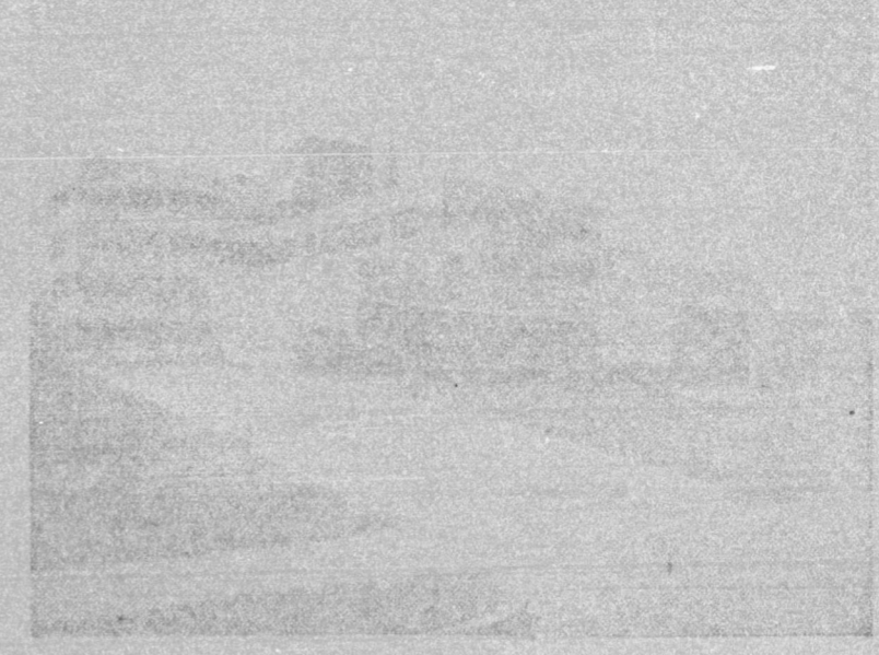
HIGH POINT MEMORIAL HOSPITAL — 100% KINGS DOWN, including the nurses' quarters!

the choice of MORE hotels, motels, hospitals and colleges... in this area... than any other mattress on the market!