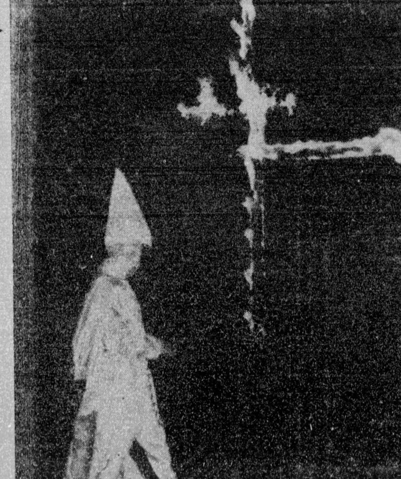
NEW ANGLE ON THE KLAN—A robed member of the Ku Klux Klan appears to be marching around a strangely-formed symbol of the order in a traditional cross-burning rally at Statesville, N. C.