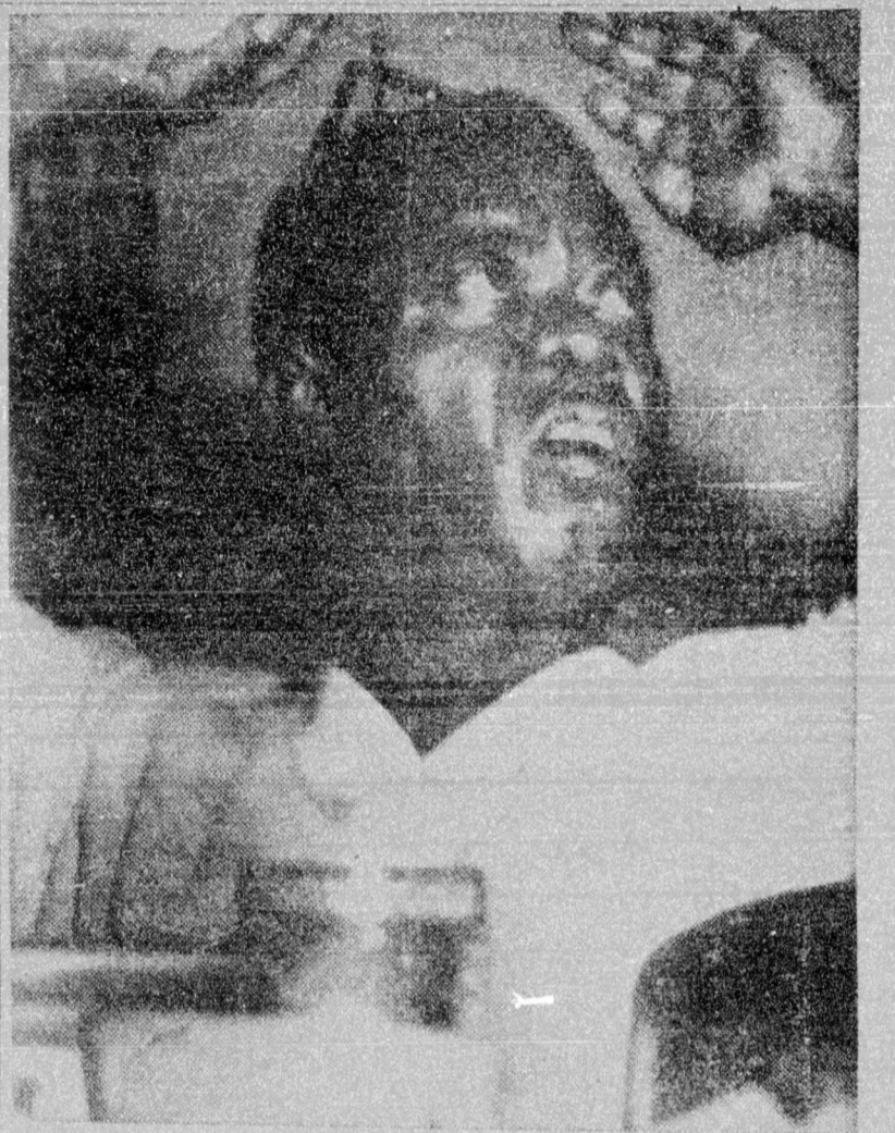
SATCH SAYS 'NO MORE TALK'—Glasses on his brow, Louis (Satchmo) Armstrong took time off from a late breakfast last week to tell reporters that he doesn't care to talk any more about his recent blast at the U. S. government on its integration policy. Louis said he wasn't retracting his statement, but that was all. His band is now appearing in Sioux Falls, S. D.