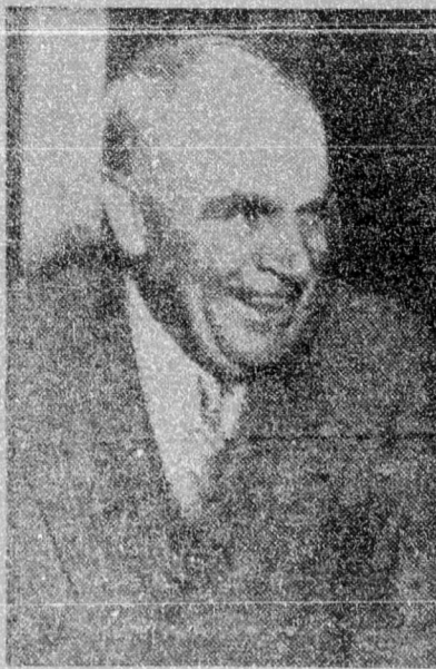
GOV. LUTHER HODGES speaks in Georgia