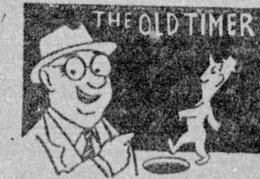
THE OLD TIMER "It's all right to hold your head up—but don't turn up your nose."