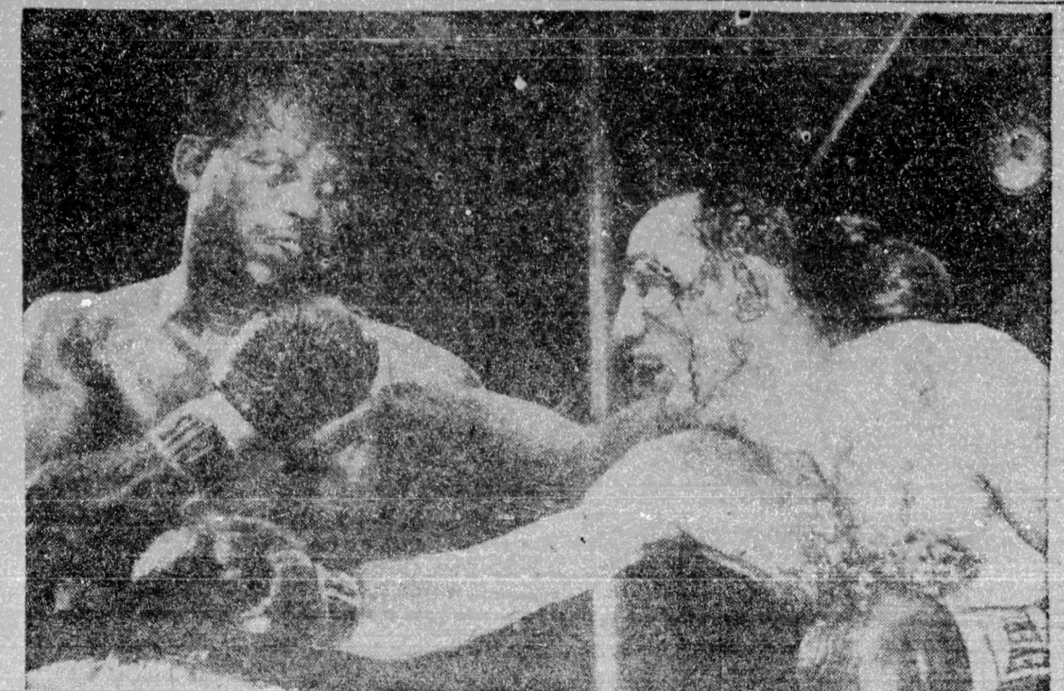
GORY GLADIATORS—Carmen Basilio's face resembles a bright mask, with blood oozing out of a cut over his left eye, as he pursues Ray Robinson in the 12th round of their recent middleweight title go in New York. Robinson, whose nose was also battered during the brawl, lost his title on a split decision. They may meet again in February.