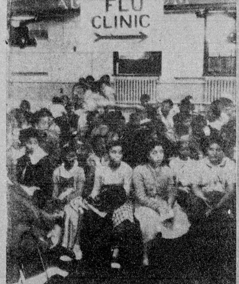
CHECKING ON FLU FEARS—Ill persons, fearing they have been stricken with Asian Flu, waited their turns at the Central Harlem District Health Clinic in New York last week. This clinic was opened to ease the pressure on the Harlem Hospital during the current epidemic. Health, hospital and welfare officials are urging New Yorkers not to flood the already heavily taxed hospitals with phone calls and visits since the disease is comparatively of a mild nature.

All purchase slips or receipts presented to your church must come from stores advertising in the CAROLINIAN.