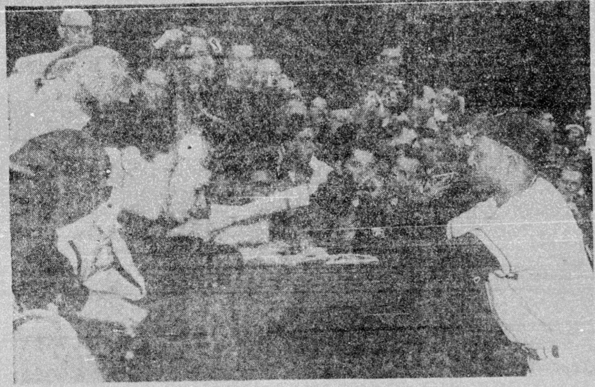
NO 'TOMORROWS'—Autograph-minded kids besiege the New York Giants' popular star, Willie Mays, at the team's last game in the stadium...