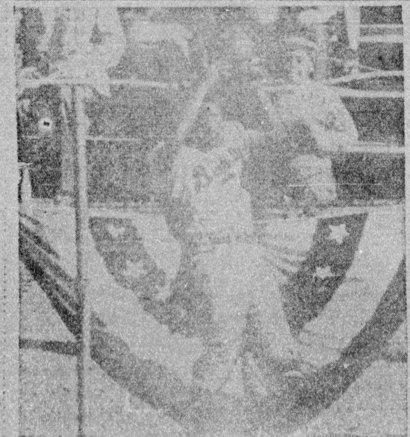
CIRCUS CATCH — Wes Covington of the Braves, who was expected to be shaky in the outfield, proved to be the defensive hero of the World Series. Here he makes a dramatic grab of McDougald's fly ball in the fifth game.

Saturday October 19th 2 P. M. Gates Open 12:00 Noon GREENSBORO MEMORIAL STADIUM Admission $2.50 Biggest Thing of Its Kind — Full Social Calendar — 2 Big Balls — Miss Long Parade — Pre-Game Show — Football at Its Best — Brilliant Halftime Activities — Music: The Famous A&T Marching Band