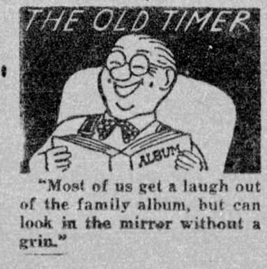
THE OLD TIMER "Most of us get a laugh out of the family album, but can look in the mirror without a grin."

THIS WEEK'S GAME (NOV. 2) FAYETTEVILLE AT BLUEFIELD DEL. STATE AT ST. PAULS ST. AUG. AT ELIZ CITY LINCOLN (PA.) AT HAMPTON HOWARD AT MINER TEACHERS J. C. SMITH AT WINSTON-SALEM A AND T AT MORGAN SHAW AT N. C. COLLEGE VA. UNION AT VA STATE