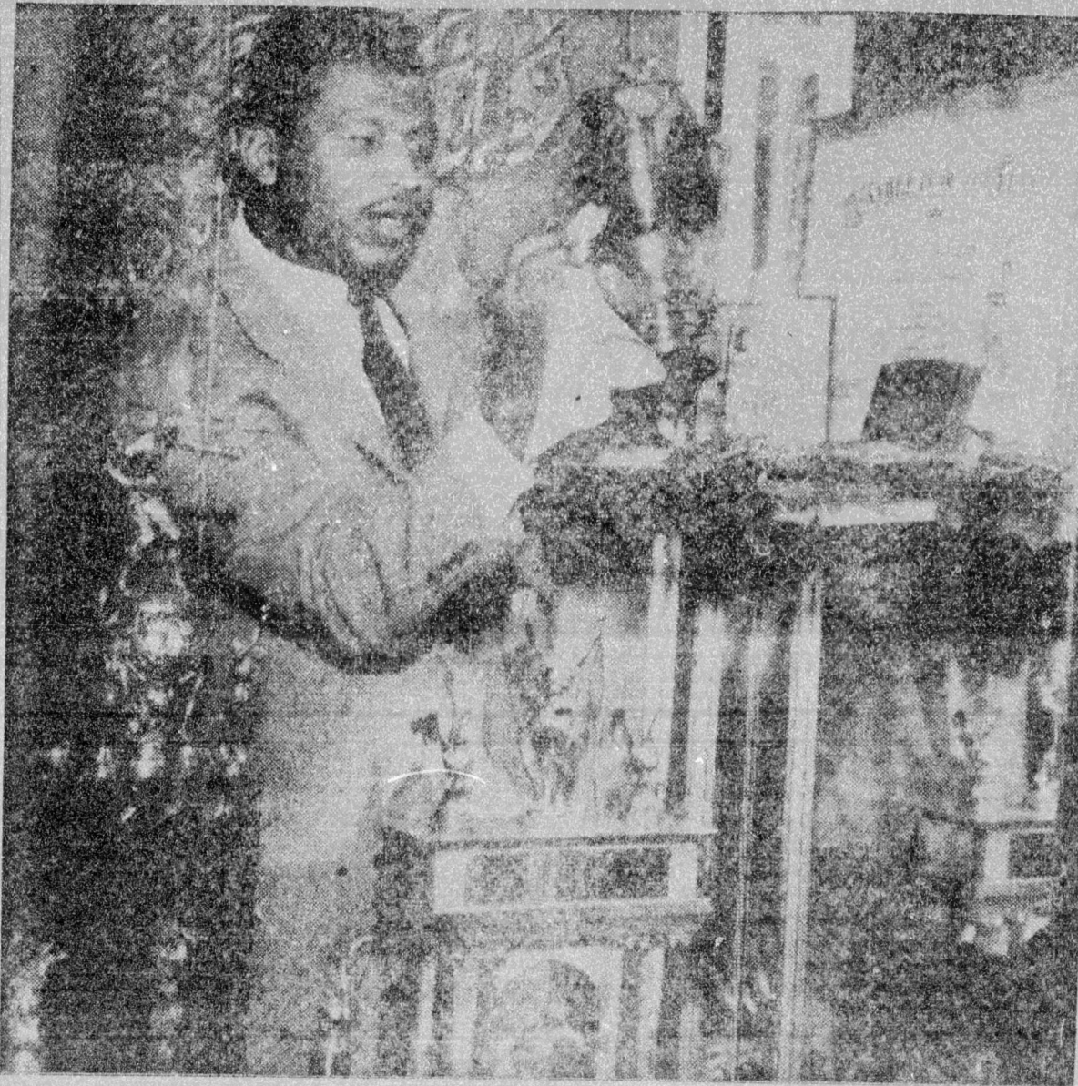
POLISHED — Sugar Ray Robinson, polished performer during his spectacular boxing career, polishes up some of his trophies in his New York apartment. Ray's getting ready for guests when he appears on CBS-TV's "Person to Person" Friday, November 8.