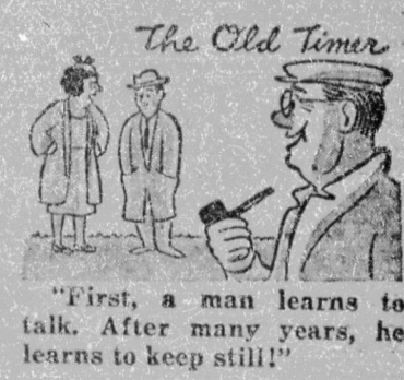
"First, a man learns to talk. After many years, he learns to keep still!"