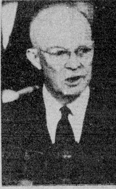
PRESIDENT EISENHOWER ... victim of mild stroke

WARWICK, Va. — Police said last week that Allegheny County, Pa., authorities have withdrawn a fugitive warrant against a Negro businessman who surrendered here November 3, as the slayer of two persons in Pennsylvania 31 years ago.