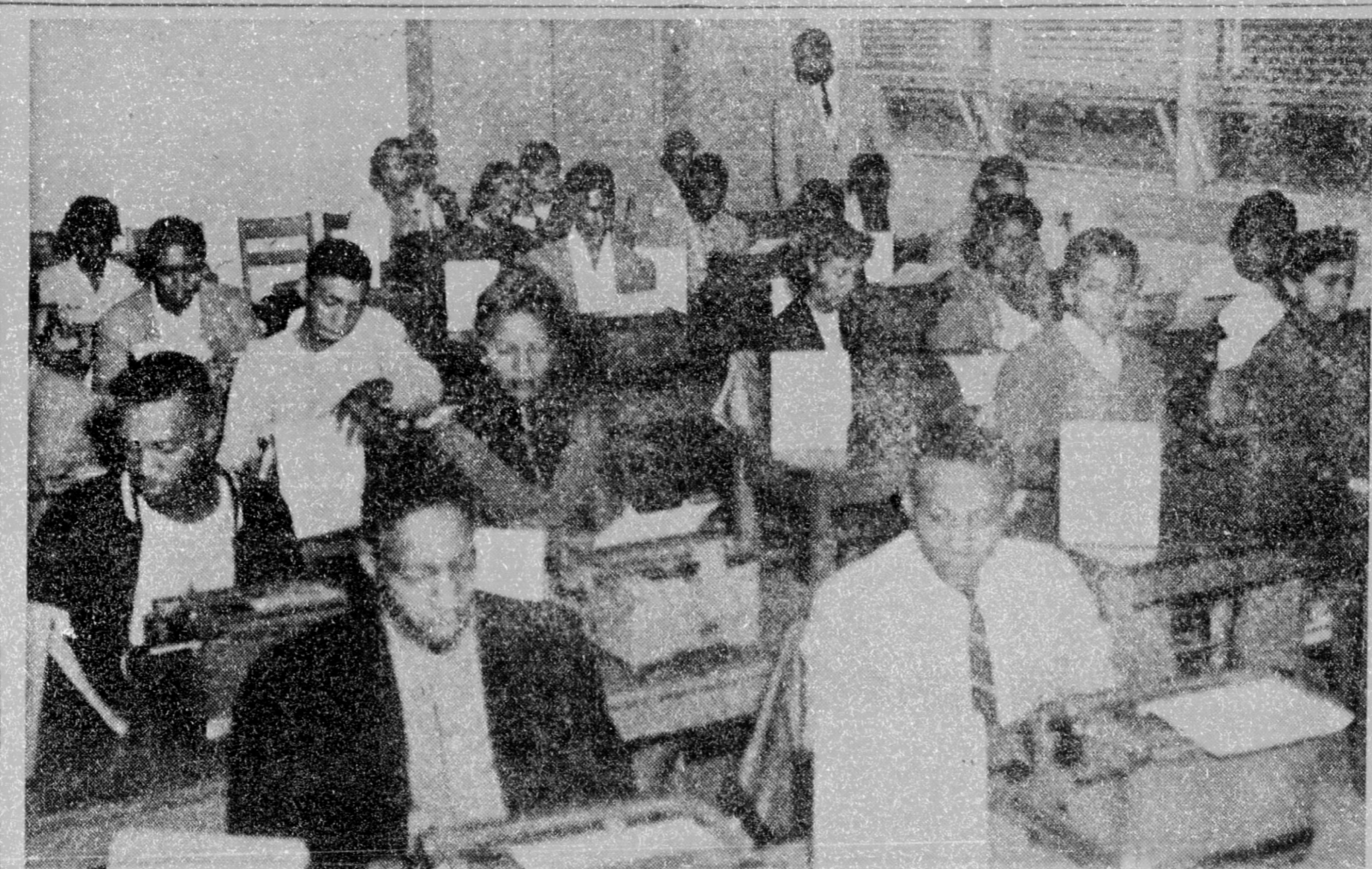
COMMERCIAL EDUCATION CLASS

The classroom portions of the building were constructed with load-bearing masonry walls, concrete floor slabs, steel joist roof, with concrete roof decks and built-up roofs.