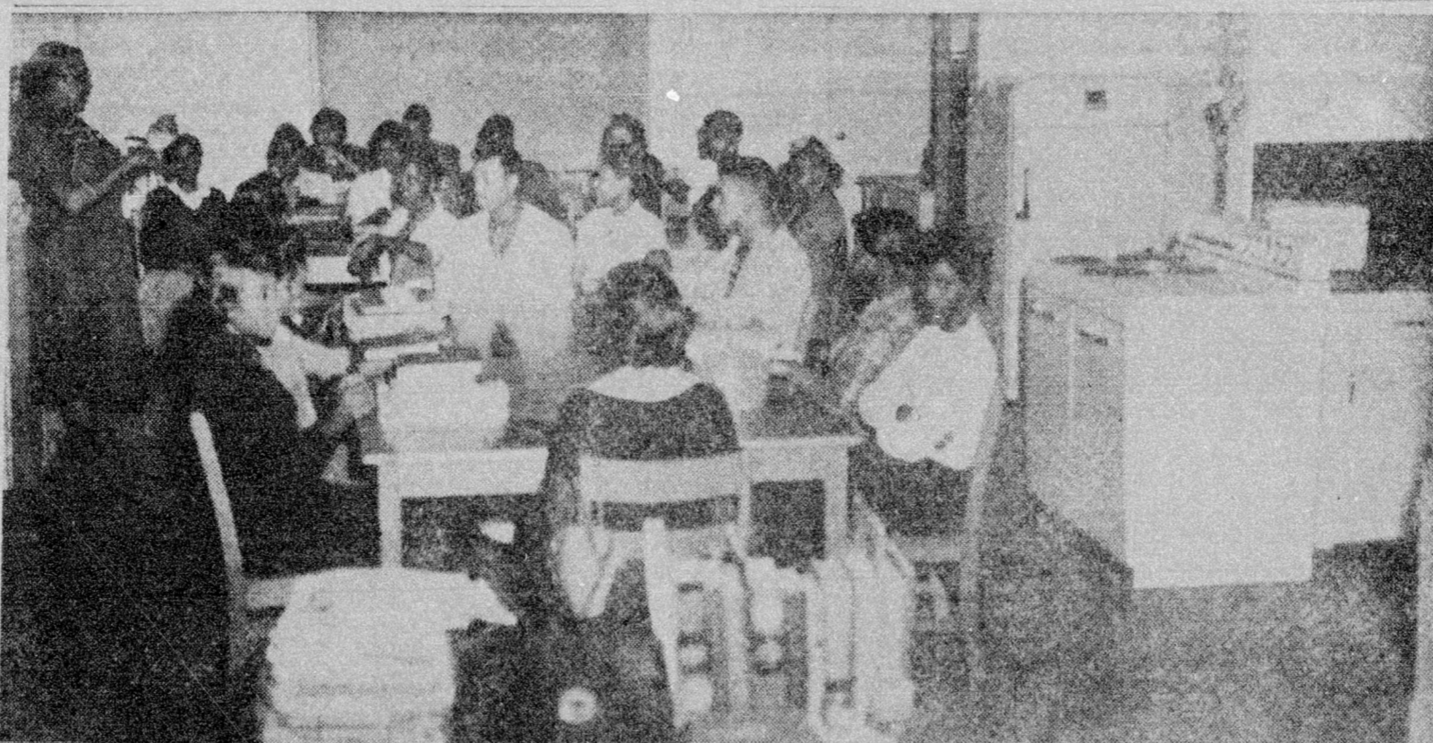
HOME ECONOMICS DEPARTMENT