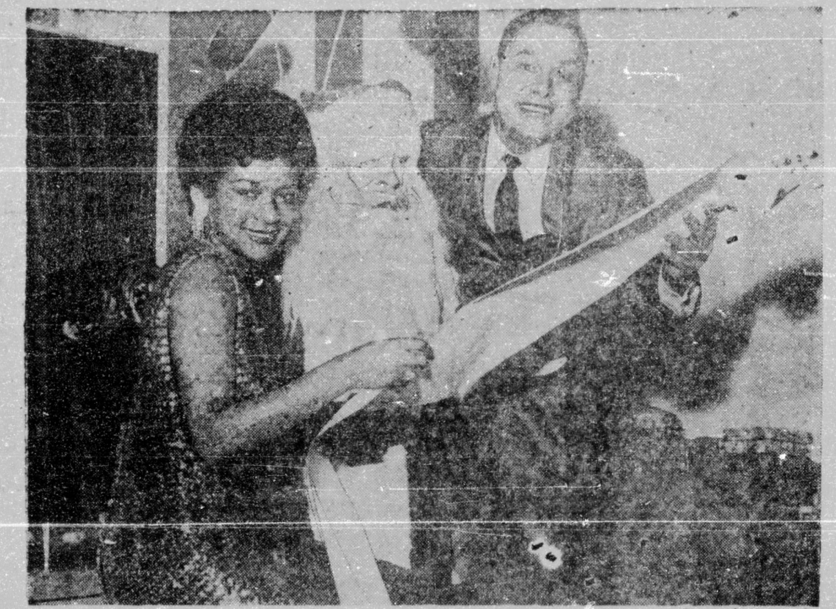
"CRAZY CHRISTMAS LIST —Lovely Sylvia Robinson, half of the sensational vocal team of Mickey and Sylvia had quite a Christmas list to present to Santa Claus, during their recent visit to a New York department store. Santa, who is used to getting long-winded requests, was bowled over by Sylvia's six-foot list, as was her partner, Mickey Baker.