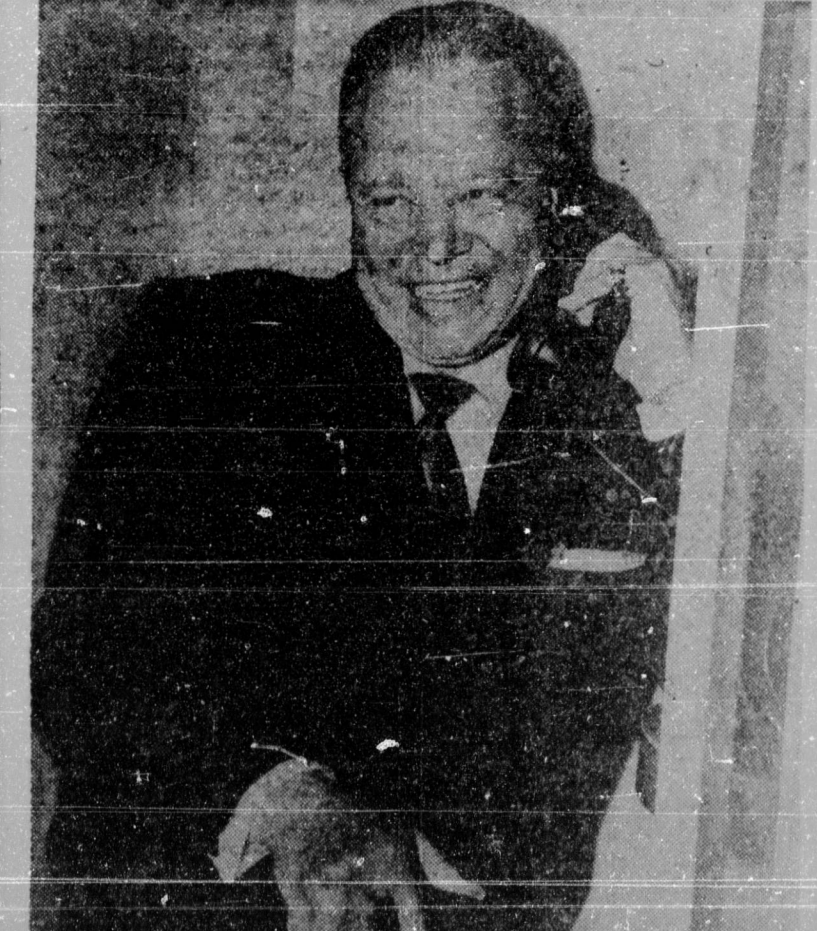
MOST HAPPY FELLAR —Singer Billy Daniels is a happy guy, a few minutes after appearing in a New York Felony court on a gun carrying charge growing out of a two-year-old Harlem shooting. Daniels was fined $200 and sentenced to four months, but the sentence was suspended. Immediately afterwards, Daniels' cabaret work permit was suspended by the Police Department, barring future nightclub engagements in New York—but "Ole Black Magic" doesn't seem the least upset.