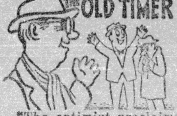
"The optimist proclaims that we live in the best of all possible worlds—and the pessimist fears that is true."

NEXT WEEK THIS REPORTER WILL CARRY YOU TO THE LUCILLE HUNTER SCHOOL.