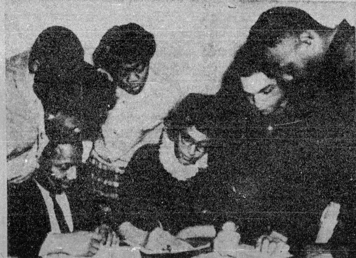
APPLY AT S. C. UNIVERSITY—Five of these seven students presented application blanks last week for admission to the University of South Carolina, but the all-white institution refused to accept them. They reported submitting more applications to the University. The group is shown here filling out the forms. They wouldn't give their names.