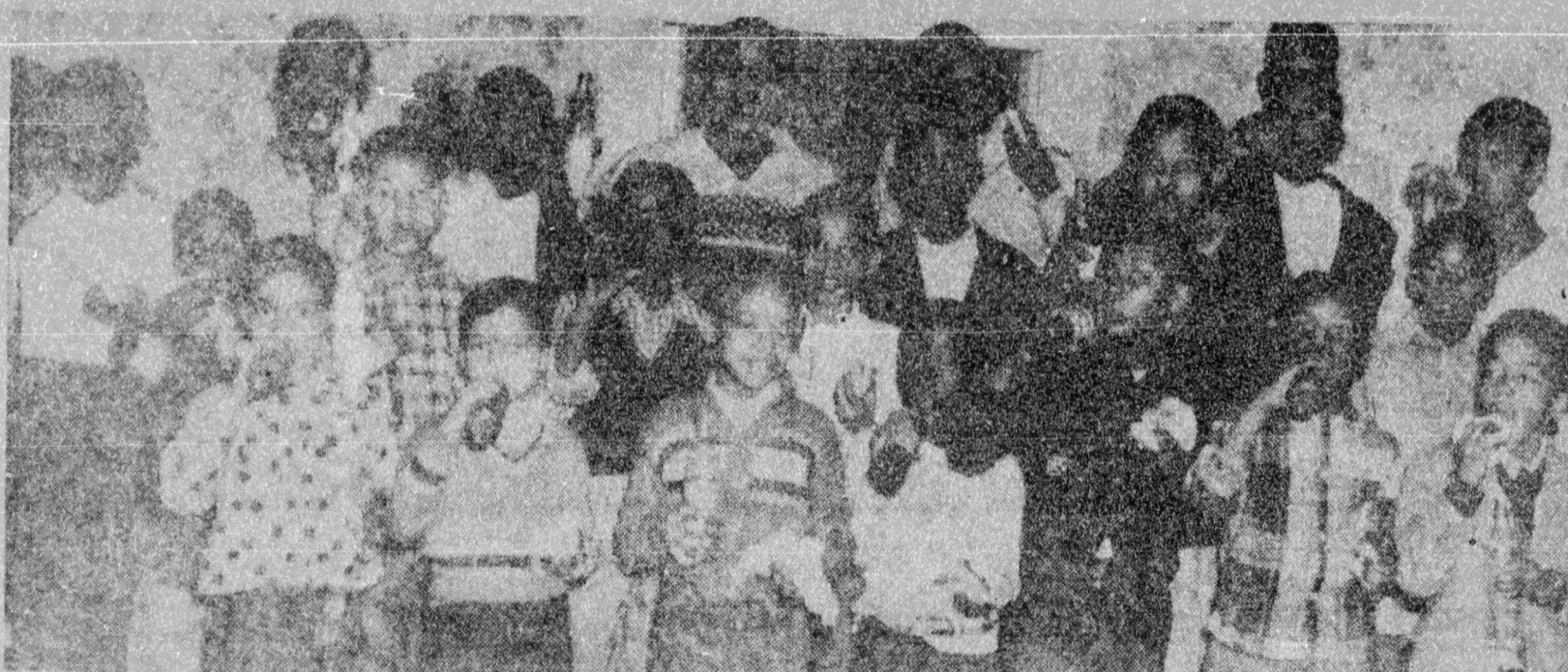
CAROLINIAN NEWS CARRIERS HOLD MEETING. PARTY NEWS-CARRIERS FROM THE CAROLINIAN held a business meeting and party at Robert's Recreation Center last Friday. The at-