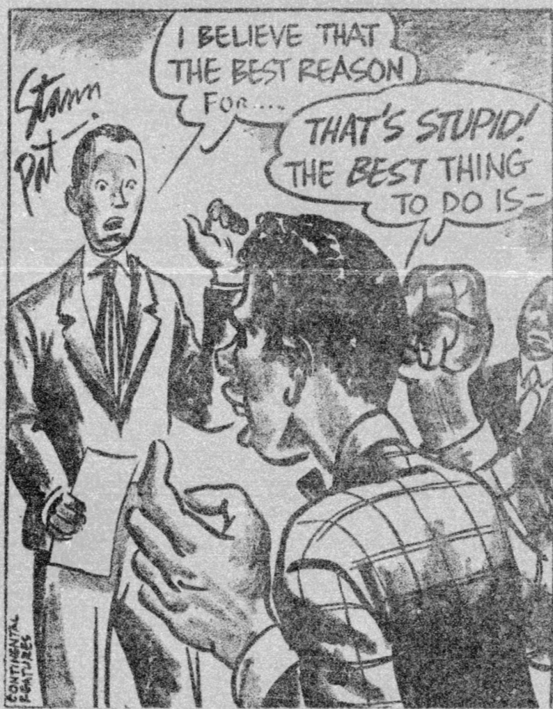
"Do Respect the Opinion of Others, Even Though You Disagree."

Animals need grain to finish out to a high grade, but too much grain is costly gain.