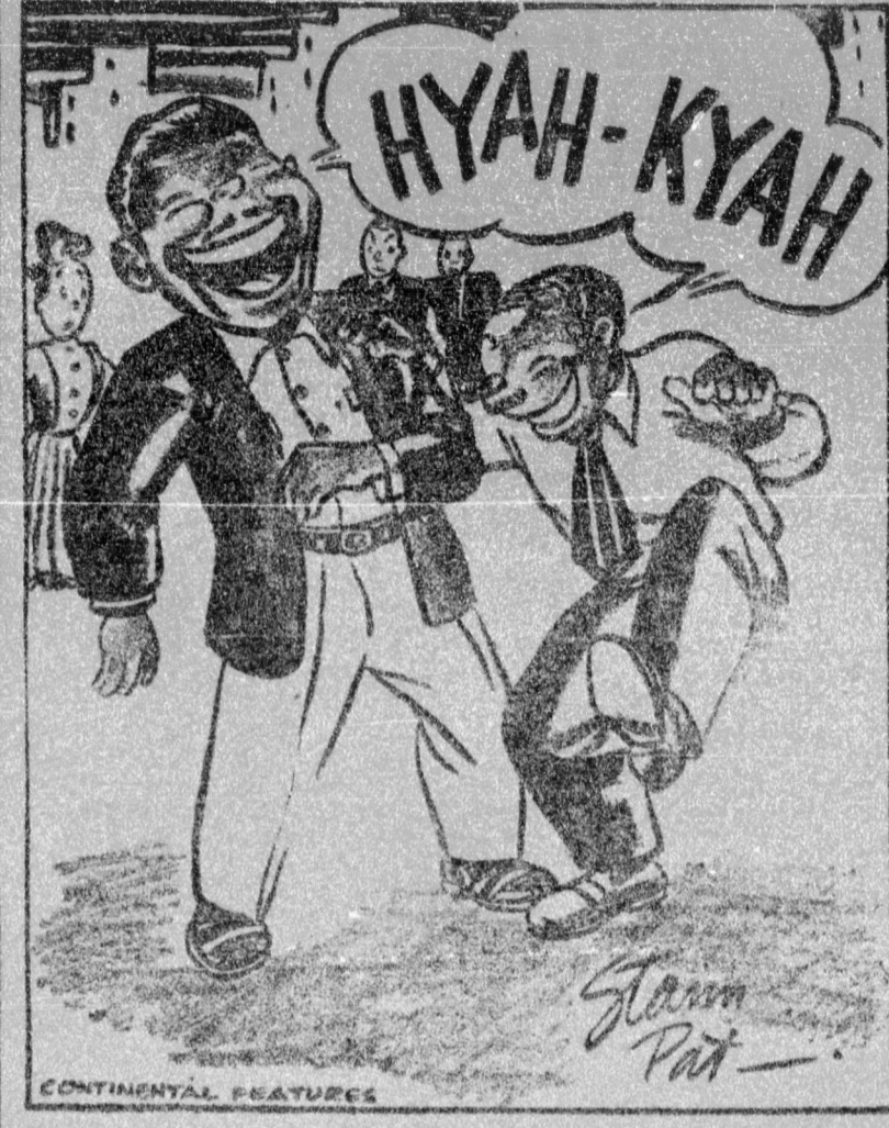
"Loud Talking in Public Can Be Annoying to Others."