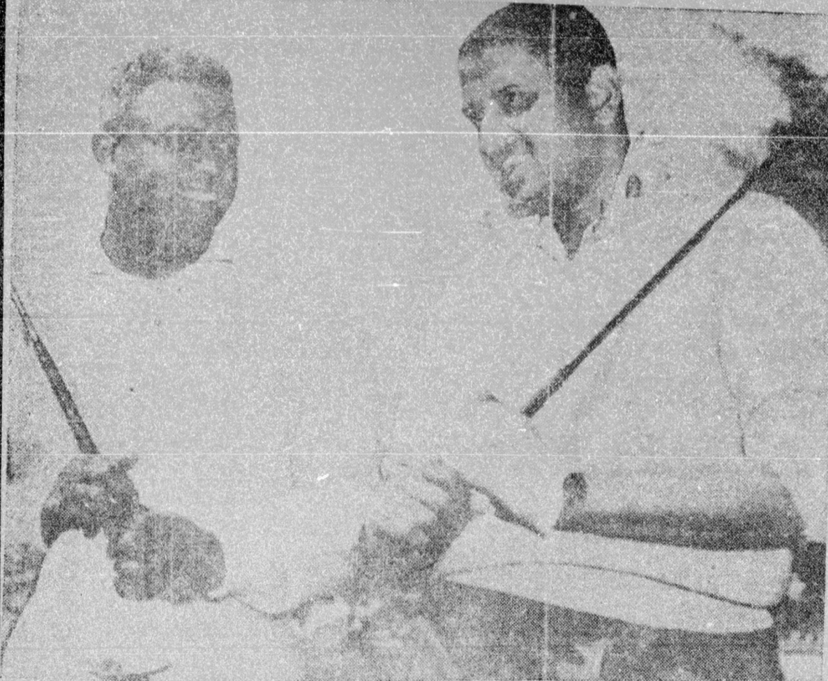
PARTING OF THE WAYS — Jackie Robinson (left), former infielder for the Dodgers baseball team, lately of Brooklyn, and his onetime teammate, pitcher Don Newcombe, get together for a few rounds of golf at the Miami Country Club recently. Robinson is now personnel manager for Chock Full-O'-Nuts in New York City. Newcombe will move to Los Angeles, Calif., with the Dodgers.