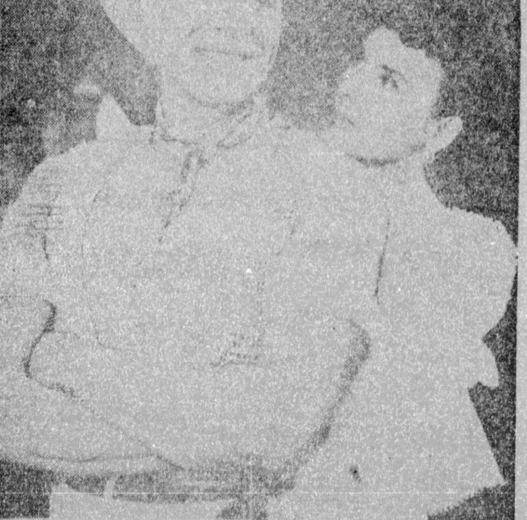
STILL BREAKING RECORDS — Lene Home's return to the legitimate stage in "Jamaica" after years as a movie and nightclub favorite, has given New Yorkers one of the happiest musicals in years. With one of the biggest advance sales in history, the show will be part of the New York landscape for a long time — a distinct tribute to Miss Home, shown here with co-star Ricardo Montalban.