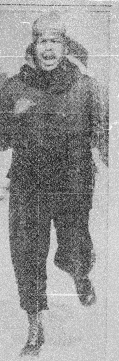
HOW TO KEEP WARM IN COLD WEATHER — Sugar Ray Robinson warms up during the current cold wave as he runs on this snow-covered track, a road near his Greenwood Lake training camp. Robinson will meet Carmen Basilio in Chicago March 25th in a bout for the middleweight title.

Crowe was a real Sparkplug for the Reds last season, filling in at the initial sack when a back injury kept Ted Kluzewski out of the lineup most of the time. Ted has since been traded to the Pittsburgh Pirates.