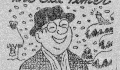
"Good health is the thing that makes you feel that now is the best time of the year!"

The Tigers will end the basketball season February 28th when they take on Houston-Tillotson college in a conference game at Austin.