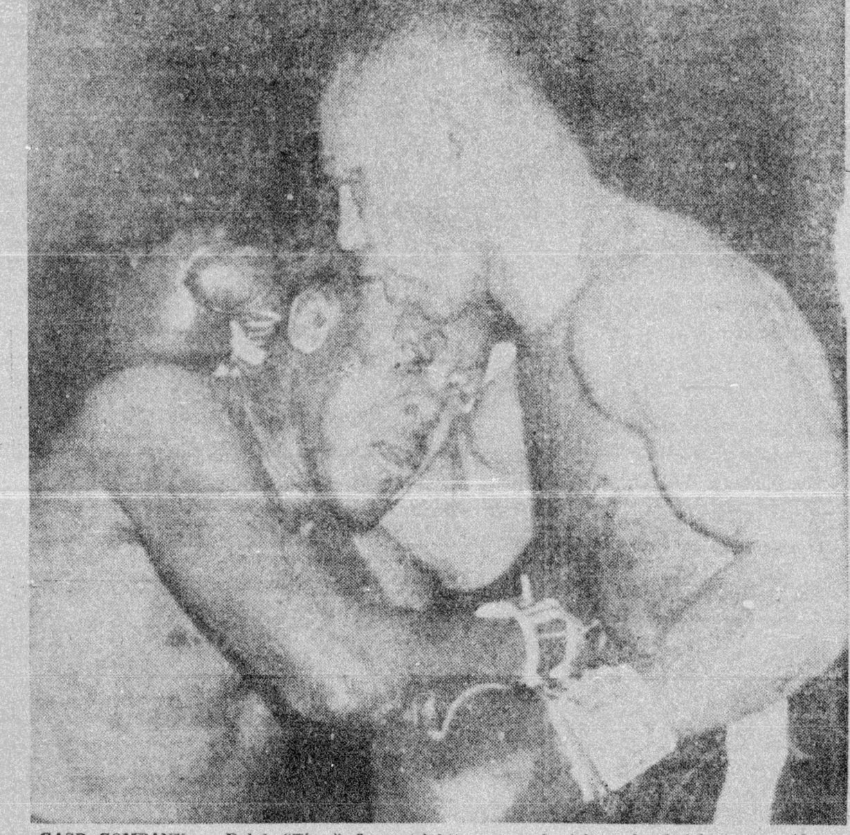
GASP COMPANY — Ralph "Tiger" Jones (right) gasps as he takes a hard right to the mid-section from Kid Gavilan, in the 7th round of their Feb. 19th bout. Middleweight Jones turned the tables on former welterweight champion Gavilan and beat him with a persistent hooking attack for a split decision.