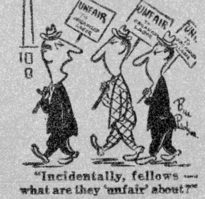
"Incidentally, fellows — what are they 'unfair' about?"