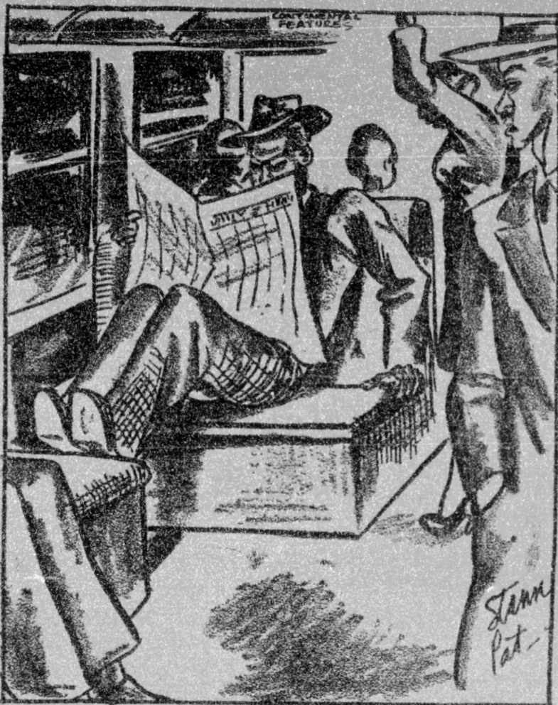
RIDE IN COMFORT, BUT ALLOW OTHERS TO DO SAME