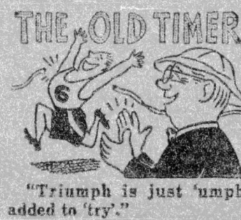
"Triumph is just 'umph' added to 'try'."