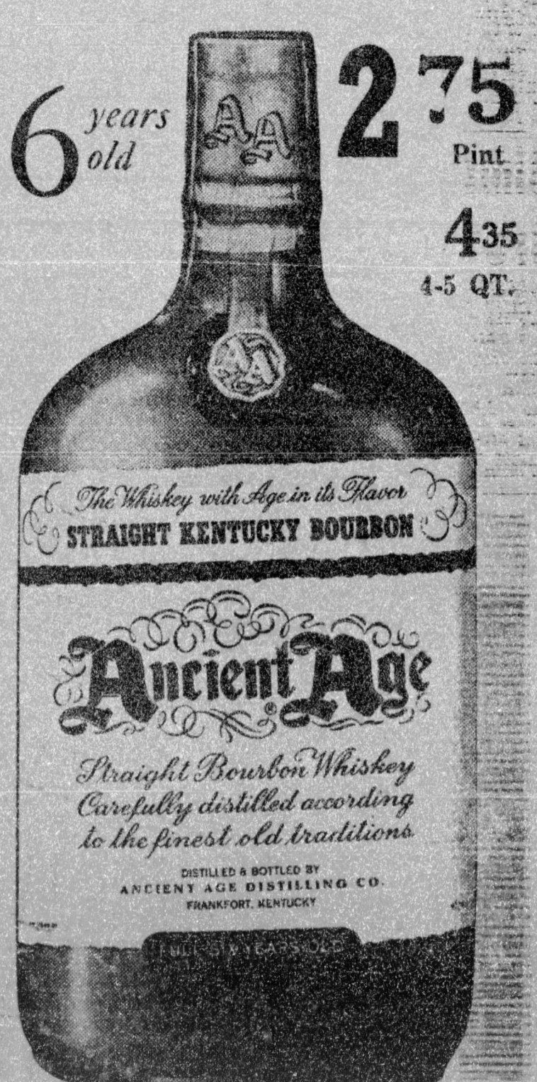
STRAIGHT KENTUCKY BOURBON WHISKEY, 86 PROOF ANCIENT AGE DISTILLING CO., FRANKFORT, KY.