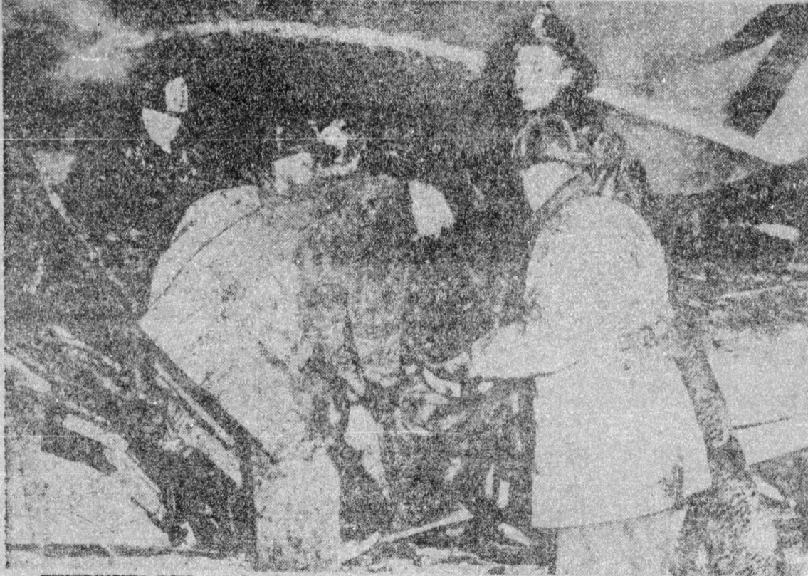
FIREFIGHTER DIES — Firemen are shown removing the body of one of their number, a victim of the recent automobile agency fire on Chicago's south side, which took the lives of three firemen. Six other firemen were injured when a wall collapsed, burying the trio.