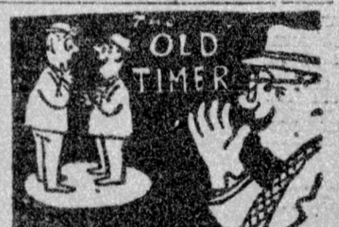
"It's a pity that people can't exchange problems. Everyone knows how to solve the other fellow's."