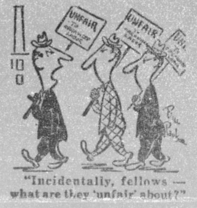
"Incidentally, fellows — what are they 'unfair' about?"

PARK & TILFORD KENTUCKY BRED STRAIGHT KENTUCKY BOURBON