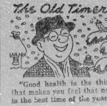
The Old Timer — "Good health is the thing that makes you feel that now is the best time of the year!"