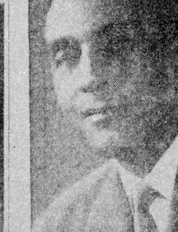
FAMU COMMENCEMENT SPEAKER — Dr. Charles Wesley, president of Central State College, Wilberforce, Ohio, will deliver the commencement address at Florida A and M University, Monday morning, June 2 at 9 o'clock. Dr. Wesley is one of the most-sought after speakers in the country.