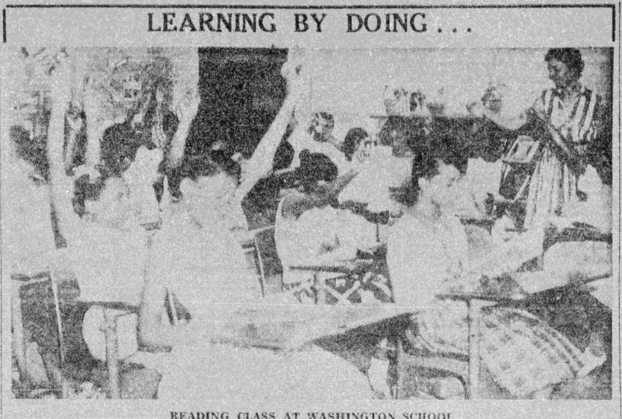
LEARNING BY DOING...

"Most of the stumbling blocks people complain about are under their hats." A plastic cover for a trench slot helps preserve the quality of the silage.