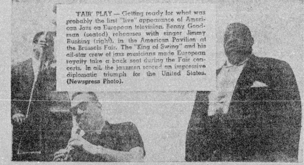
"FAIR PLAY" — Getting ready for what was probably the first "live" appearance of American Jazz on European television, Benny Goodman (seated) rehearses with singer Jimmy Rushing (right), in the American Pavilion at the Brussels Fair. The "King of Swing" and his all-star crew of jazz musicians made European royalty take a back seat during the Fair concerts. In all, the jazzmen scored an impressive diplomatic triumph for the United States. (Newspaper Photo).