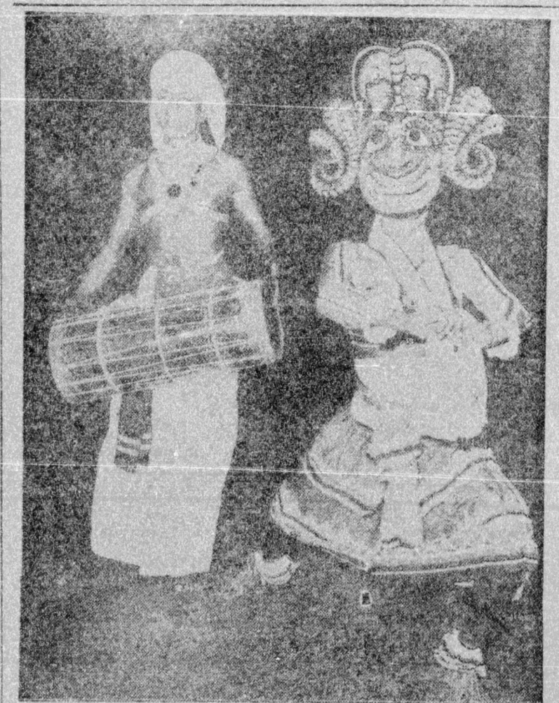
EAST GOES WEST — This handsome couple, looking like an illustration from the "Arabian Nights", are members of the Ceylon National Dancers, rehearsing the colorful Mask Dance. The company is presently in Paris for a season of ceremonial, traditional and classical dances. (Newspress Photo).