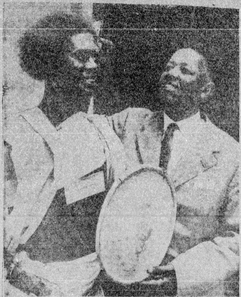
WILD AND WOOLY —Tidying up a well-thatched "friend", an amateur barber runs the risk of losing his comb in the healthy mop of hair atop a beaming Somaliland warrior. The lifelike statue of the warrior is located in Rome's African museum, on the grounds of the city's zoo.