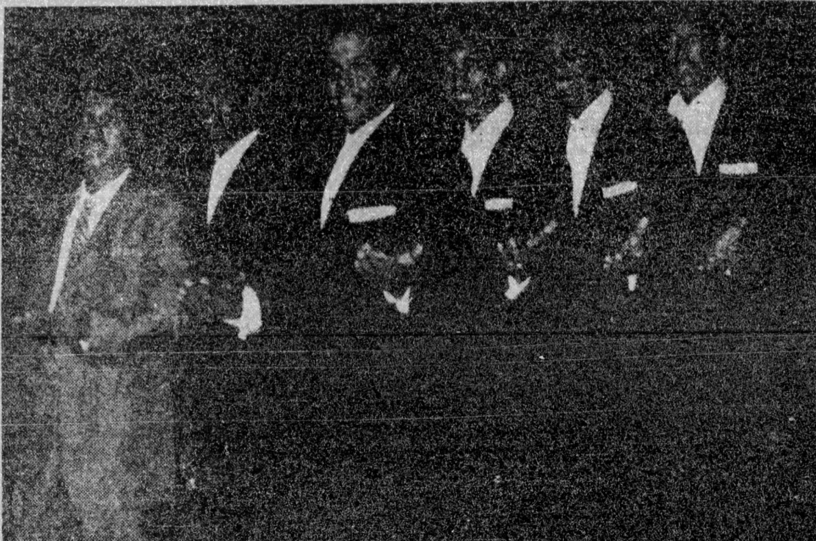
THE CHORVETTES, popular local singing aggregation, are still uppermost in the minds of area Rock 'N Roll music lovers for their rendition of the tune, "Cheer Up Pretty One," backed by "Buzs Me On The Telephone." The group, pictured above, during a recent appearance at Raleigh Memorial Auditorium, is now making plans to record a series of new songs.