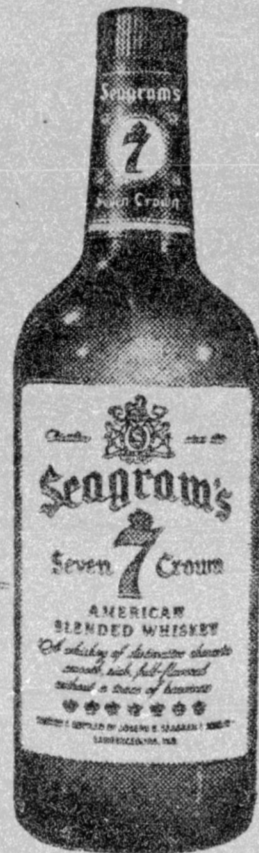
SEAGRAM DISTILLERS COMPANY, NEW YORK CITY, BLENDED WHISKEY 50 PROOF, 95% GRAIN NEUTRAL SPIRITS.