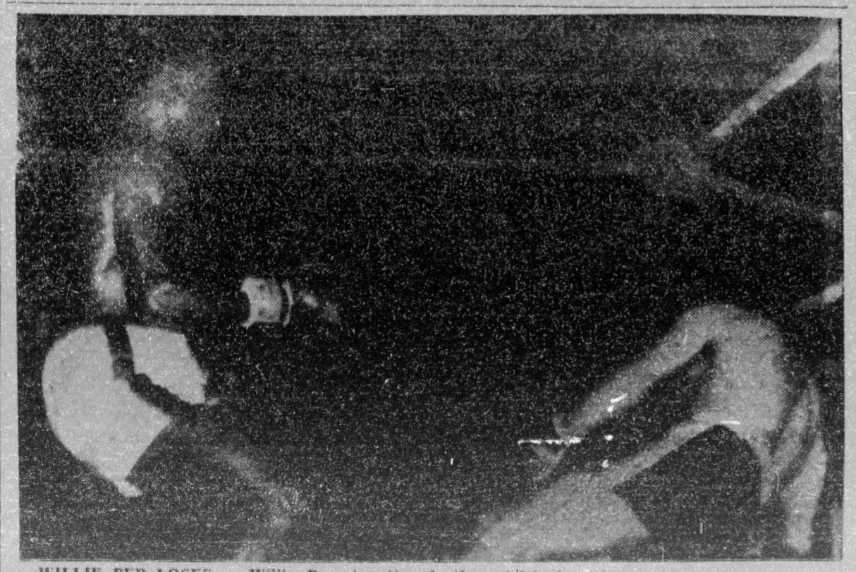
WILLIE PEP LOSES — Willie Pep, two-time featherweight champion, is knocked to the canvas by featherweight champ Hogan "Kid" Bancy for the second time in the ninth round of their 10-round title bout at the Boston Garden last week. The 36-year-old Pep reached his feet at the count of 10, but the referee stopped the fight.