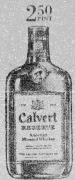
Calvert RESERVE American Whiskey CALVERT DISTILLERS CO., N. Y. C. • 56 PROOF 85% GRAIN NEUTRAL SPIRITS • BLENDED WHISKEY