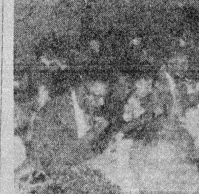
HUSBAND AND WIFE BANQUET — The Home Demonstration Clubs of Duplin County plan yearly a Husband and Wife Banquet as one of their special activities for the year. Here the group is enjoying themselves. The group held their banquet this year at the Rose Hill Elementary School, Rose Hill, North Carolina.