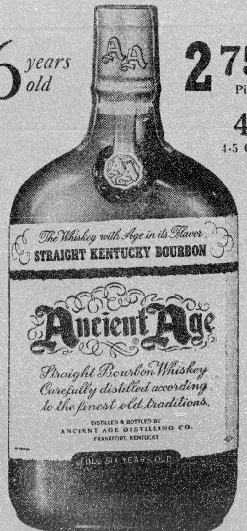
STRAIGHT KENTUCKY BOURBON WHISKEY, 86 PROOF ANCIENT AGE DISTILLING CO., FRANKFORT, KY