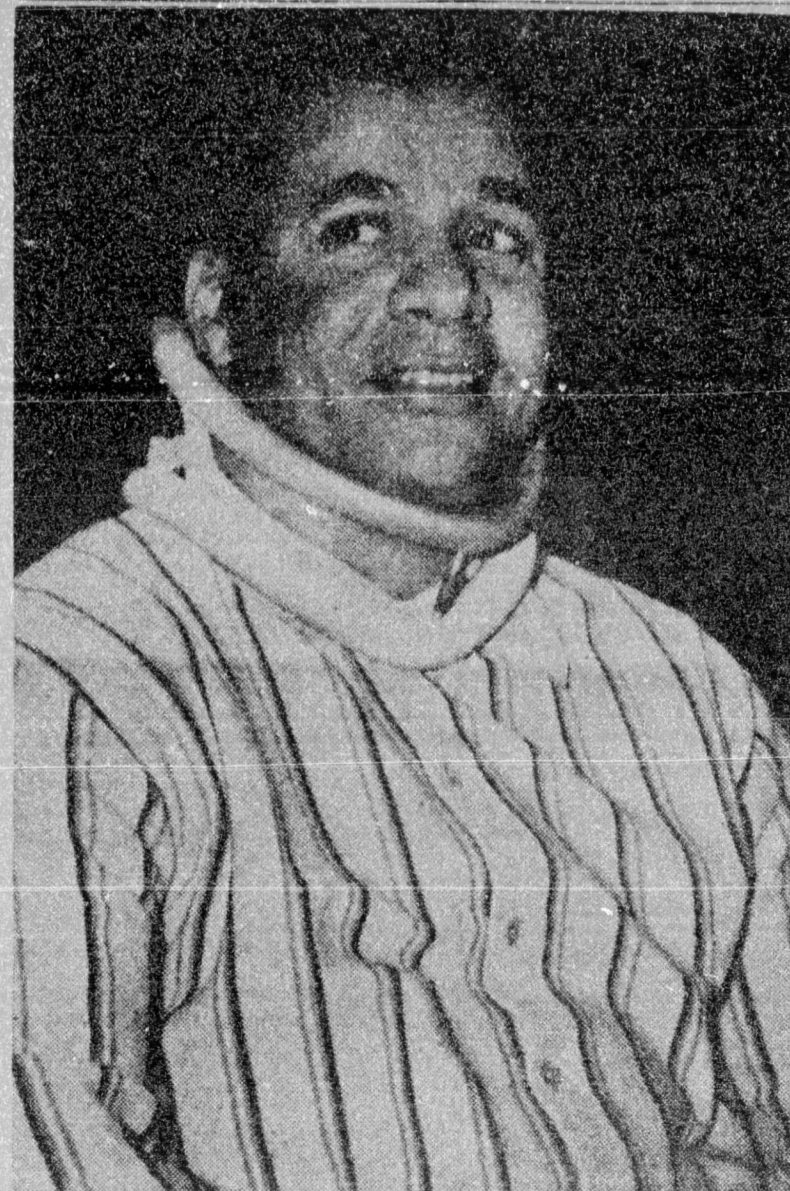
BASKETBALL FAN — Former Brooklyn Dodger catcher Roy Campanella smiles from his seat on the sidelines at the Harlem Globetrotters-Philadelphia Sphas exhibition game at Madison Square Garden recently. Although he still wears a neck brace, Campy seems to be making progress in his recovery from an auto accident.