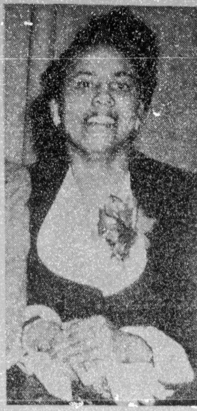
MARRIES A NEW YORKER