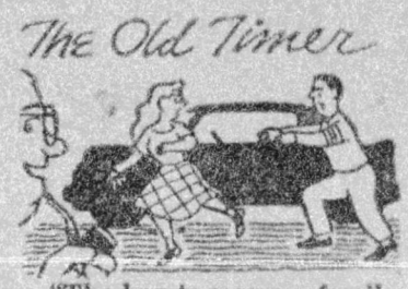
The key to many a family row is the one that fits the

"And when conditions warrant, needed to provide more reliable he takes time to put on tire chains stop-and-go traction.