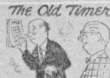
"Of course, life doesn't begin at 40 for the fellow who went like 60 when he was 20."