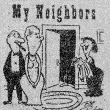
My Neighbors "My husband has to be different—he gets claustrophobia in open spaces!"