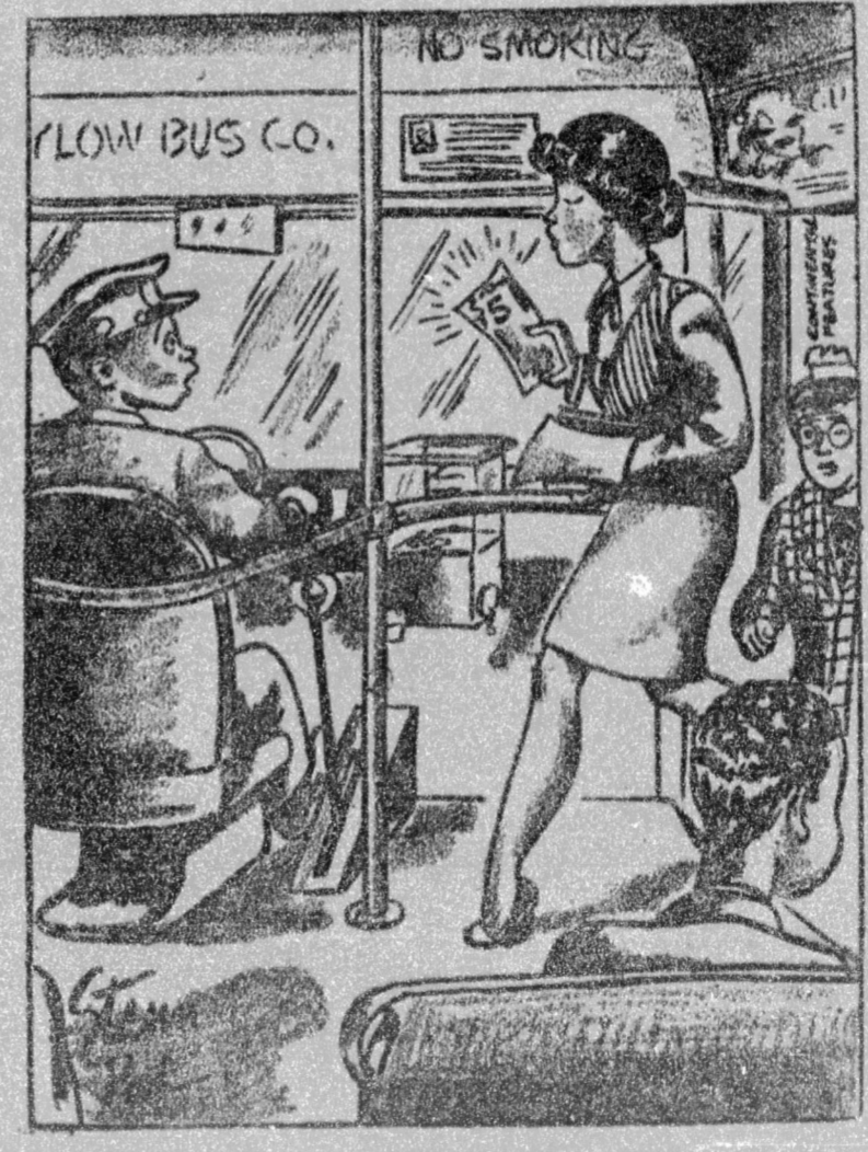
Try and Be More Considerate. Have the Correct Change Ready.