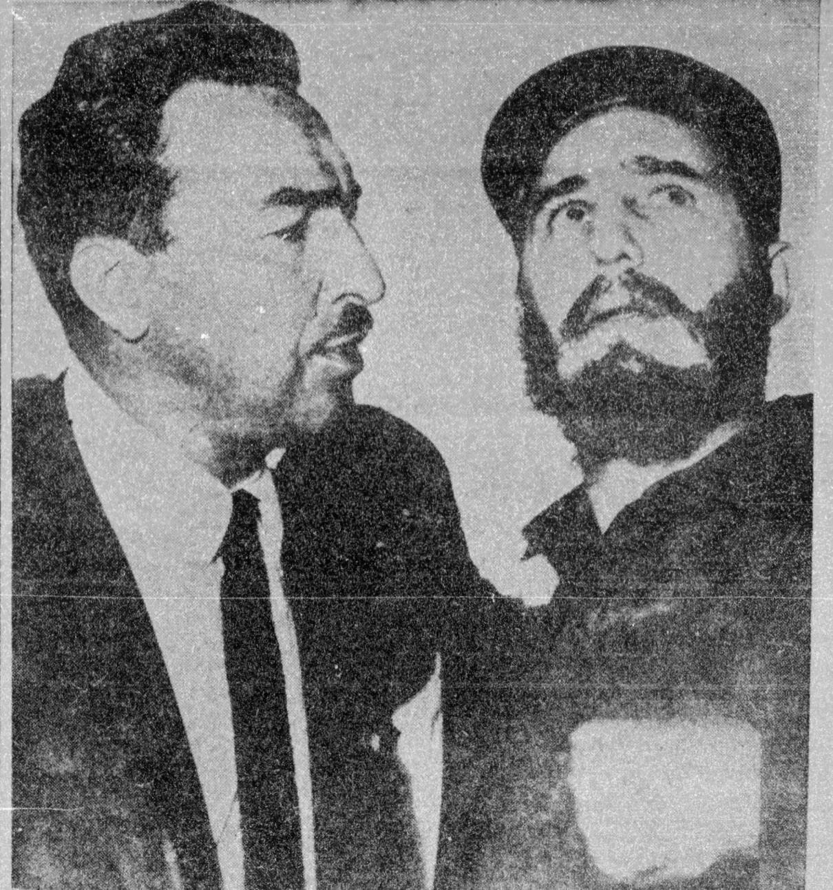
POWELL CHATS WITH CASTRO — Representative Adam Clayton Powell (R-N.Y.) speaks to Rebel Leader Fidel Castro, right, during the January 21st demonstrations in which tens of thousands of Cubans gathered to cheer approval of the wholesale executions of Batista "war criminals". Powell was one of the two U. S. Congressmen invited to Havana, Cuba to witness the demonstration. The other was Rep. Charles C. Porter (D-Ore.).