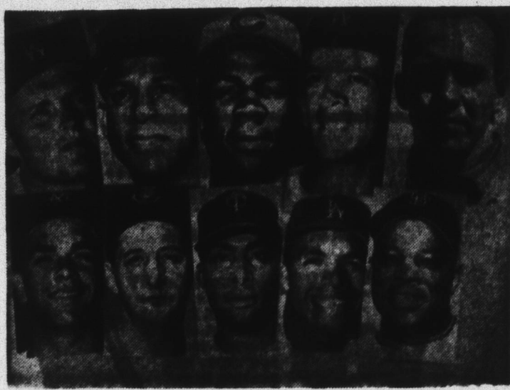
ALL-STARS —New York: Shown in the photo above are the ten players named to the UPI 1962 Major League All-Star team. They are: (top row, left to right): Don Drysdale, of the Los Angeles Dodgers; Orlando Cepeda, of the San Francisco Giants; Frank Robinson, of the Cincinnati Reds; Maury Wills, of the Dodgers; and Brooks Robinson, of the Baltimore Orioles. Bottom row (left to right): Bobby Richardson, of the New York Yankees; Dick Donovan, of the Cleveland Indians; Earl Battey, of the Minnesota Twins; Tommy Davis, of the Dodgers; and Willie Mays, of the Giants.