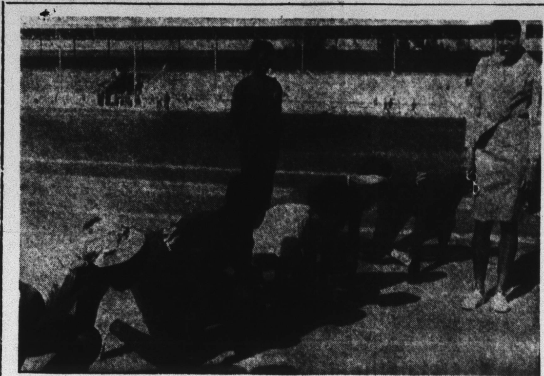
WOMEN ATHLETES AT DAKAR — Wilma Rudolp, the "Black Gaselle" is shown giving instruction to the equad of feminine athletes from Senegal.