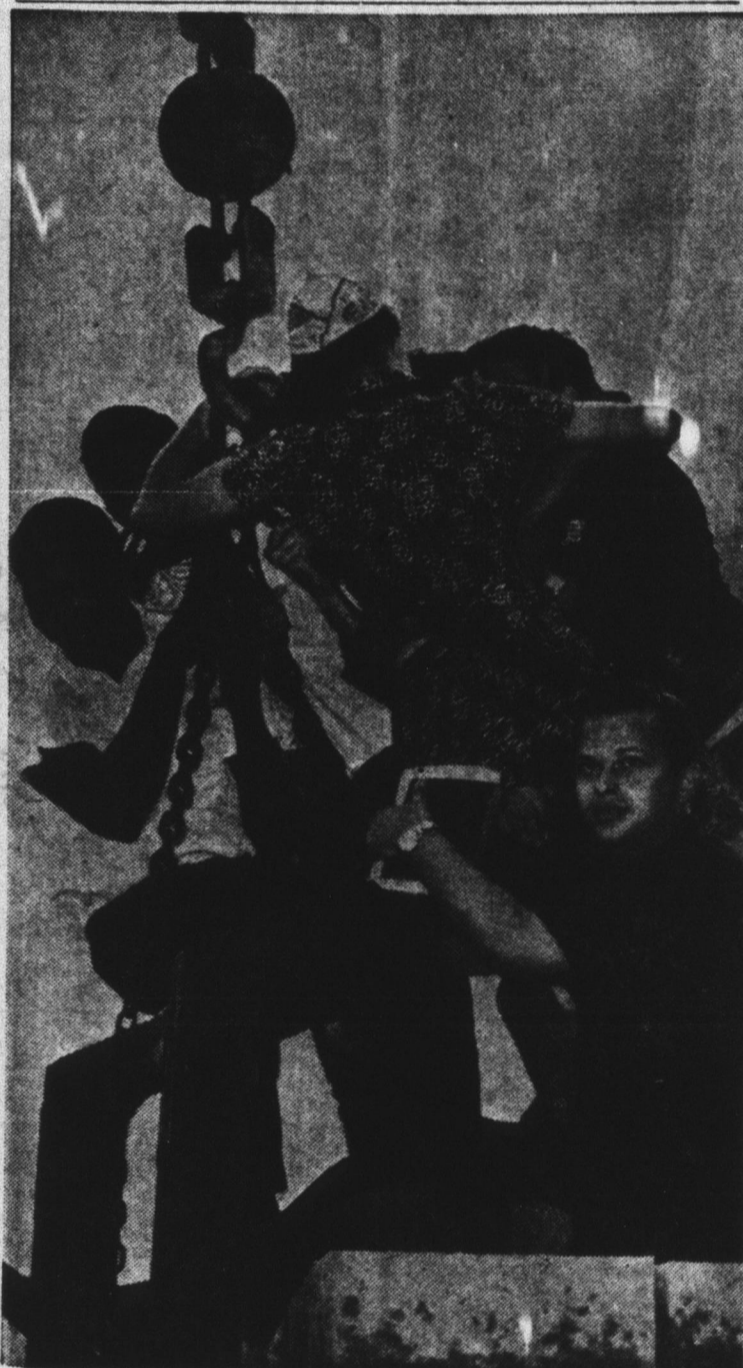
PICKETS HOLD TIGHT — Pickets hang onto chain and crane's unloading gear atop cement blocks in Brooklyn, N. Y. The blocks were about to be removed from a track at construction site of Downstate Medical Center there last week. The demonstrators were protesting the alleged segregation in hiring for public-financed construction projects.