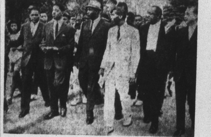
World heavyweight boxing champion Sonny Liston (third from left and wearing hat) helps form a civil rights march in Denver July 28th. The march comprised a walk through downtown Denver to mail letters urging Colorado legislators to help pass President Kennedy's civil rights package. Liston did not make the full march.