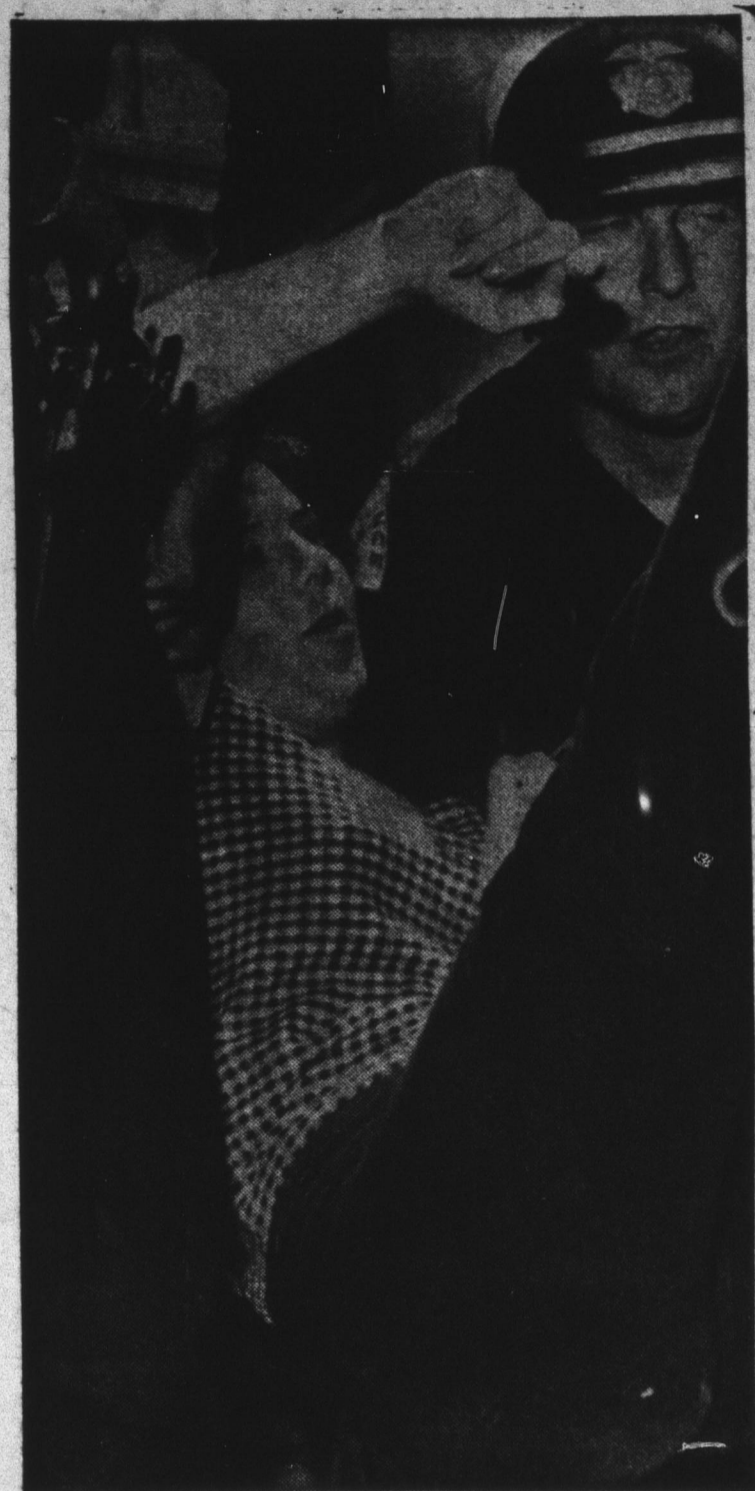
REMOVED BODILY — An unidentified white woman demonstrator from the Congress of Racial Equality (CORE), is taken bodily from a housing tract by Terrance, California police last week. She was one of 150 demonstrators, including Academy Award-winner Marlon Brando, picketing the site to protest alleged racial discrimination. Thirty-three persons were arrested on charges of trespassing. Brando was not among those arrested.