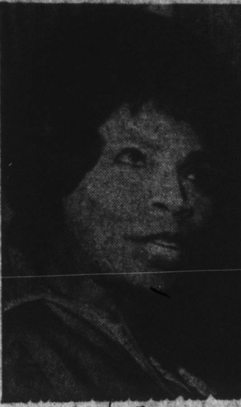
MISS MARIAN ANDERSON