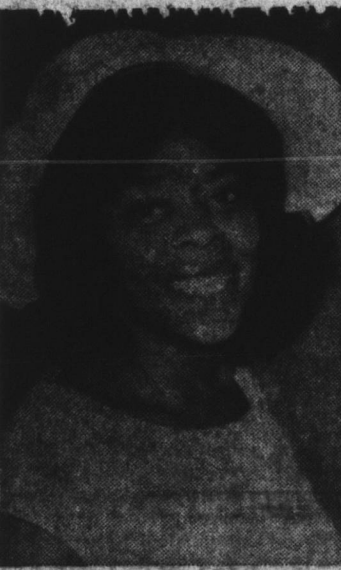
MISS DINAH WASHINGTON