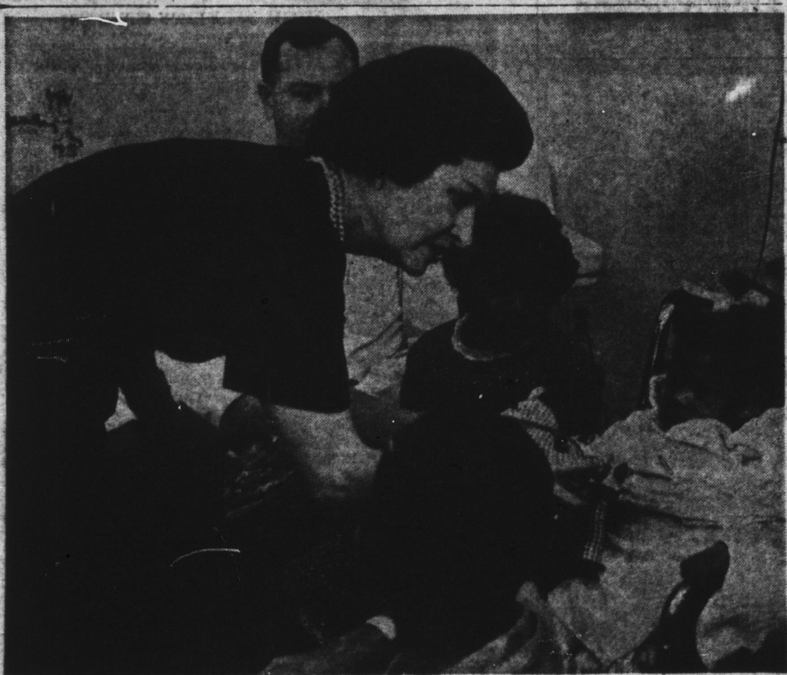
GIFTS FOR HOSPITALIZED CHILDREN—Mrs. Lyndon Johnson is shown distributing toys, collected by Mrs. John F. Kennedy, to hospitalized children at D. C. General Hospital last week. Mrs. Kennedy was originally scheduled to make the visit, but asked the new First Lady to take over her appointment.