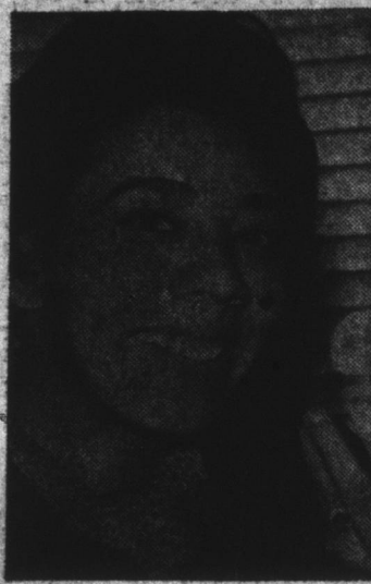
MISS ALTHEA GIBSON