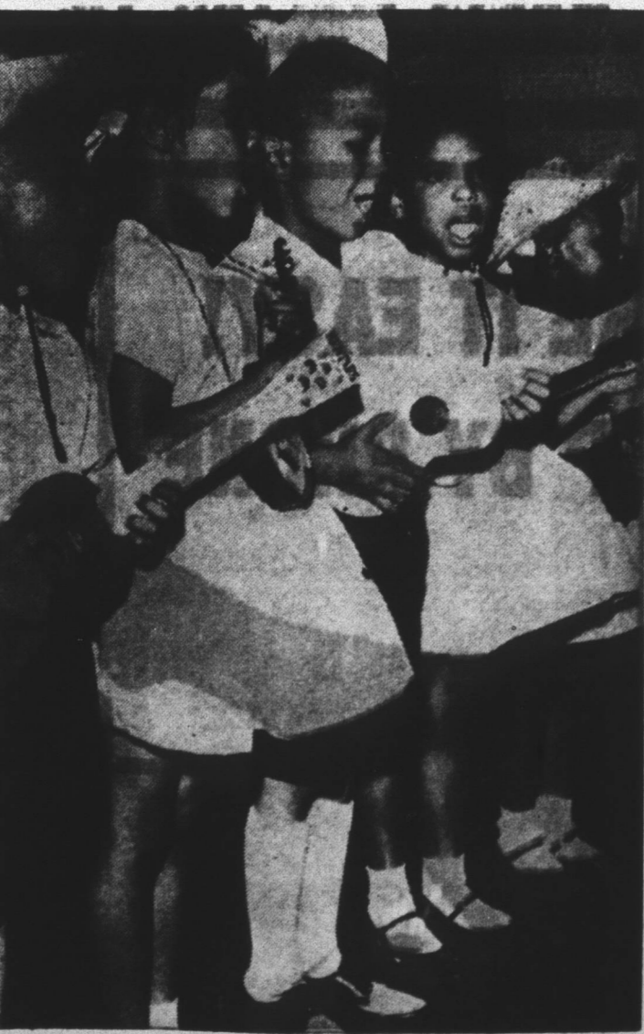
JUVENILE HOOTENANNY —They may not be "Beatles," but these youngsters at Bennett College's Children House gave it everything they had during "commencement" program marking end of their school year last week.